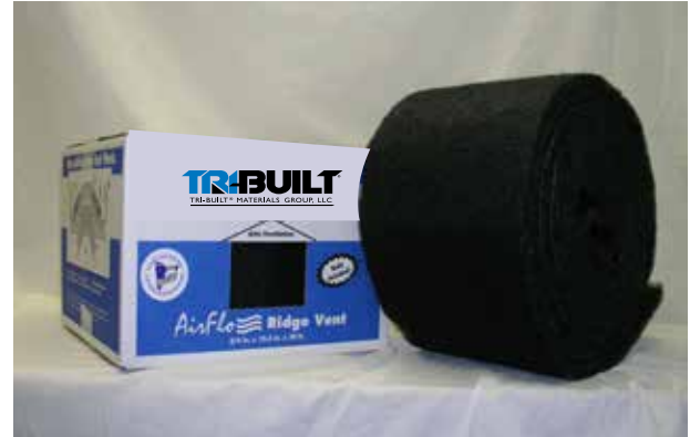
Net Free Area table - when no Moisture Barrier is installed. 1 square foot total net free area per 150 square feet of attic.

Requires soffit ventilation NFA in an amount equal to or greater than the amount of ridge ventilation NFA. This means for every square inch of installed NFA at the ridge you need at least that amount of the soffit.