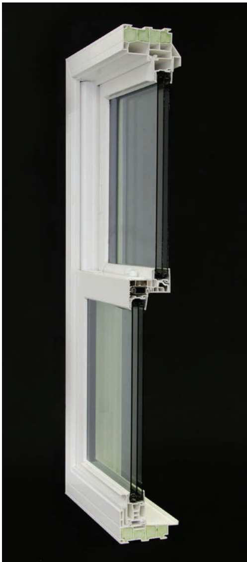
Shown with optional foam enhancement and triple-pane glass