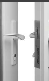
Exterior keyed lock