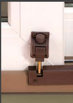
Multi-position optional footbolt