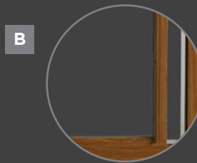
B Left and right pull rails for ease of operation