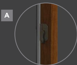
A Flush-mounted cam-action locks