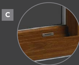
C Ventilation limit latches