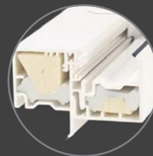
C I-Force fiberglass-reinforced sash meeting rails on units configured with optional Energy Upgrades