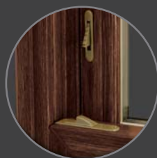
B Ventilation limit latches