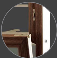
D Ergonomically designed tilt-latch for ease of cleaning