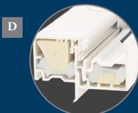
D I-Force fiberglass-reinforced sash meeting rails