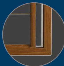
B Left and right pull rails for ease of operation